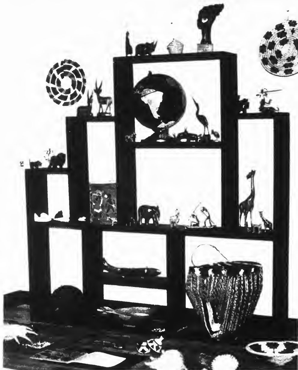
AFRICAN ARTIFACTS— These souvenirs are among the collection on display in the showcases on the third floor of the Administration Building which were collected by

Nashville-March 21, Central High, 9:15 a.m., and Isaac Litton, 1 p.m. March 22, East Nashville High, 9:30 a.m., and Donelson, 1:20 p.m.